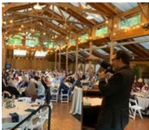
Suquamish Tribal Chairman and Suquamish Foundation President speaking at A Time to Gather

It was an honor for us at the Suquamish Foundation to have had our friends join us at our first fundraising event of the year; "A Time to Gather" on April 27 th , 2019 at the beautiful Kiana Lodge where we enjoyed dinner and cocktails, both a live and silent auction featuring original art by Native artists and donated experiential activities. With our friends, community members, dig-